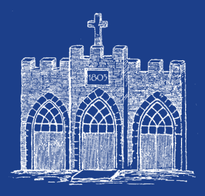
(Sketch of front of Catholic Church from 1803 by Miss Creden, drawn for Trimble 1880)